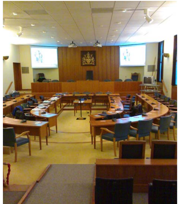
A much more formal setting within a council chamber.

Our trainers are all proficient and have a great deal of experience in the practical application of health and safety. Our presentations use a wide range of training styles from graphical presentation, learning exercises and use of video/dvd and CCTV systems.